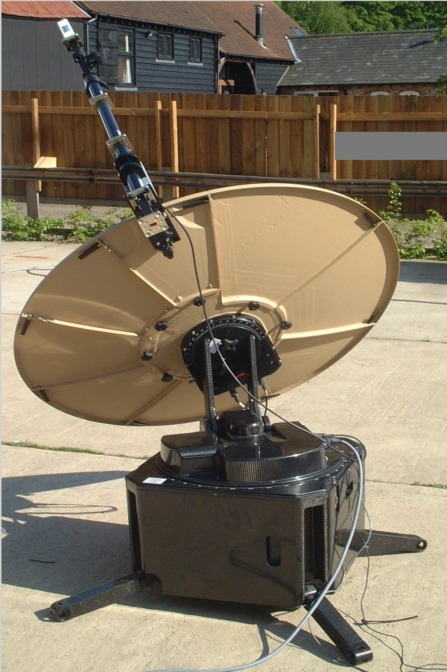
The FA-120 Antenna

Lightest most compact 1.2m flyaway antenna